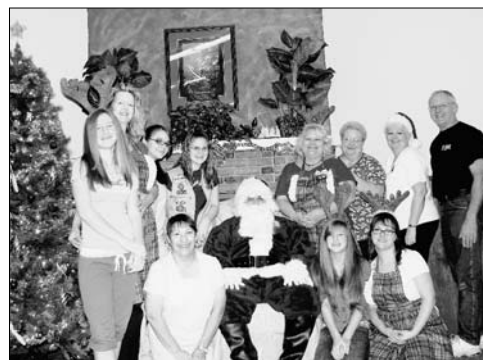
Special to the Chronicle